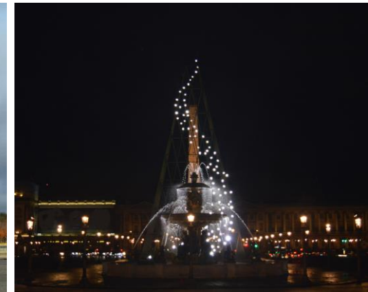
PHARES on Place de la Concorde, Paris by day and night © Milène Guermont / ADAGP